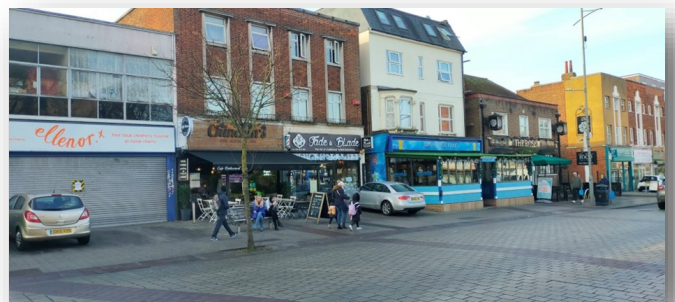
Ellenor closed as the landlord refused to deal with the damp problem