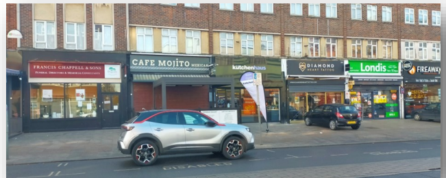
Some of the small shops we visit